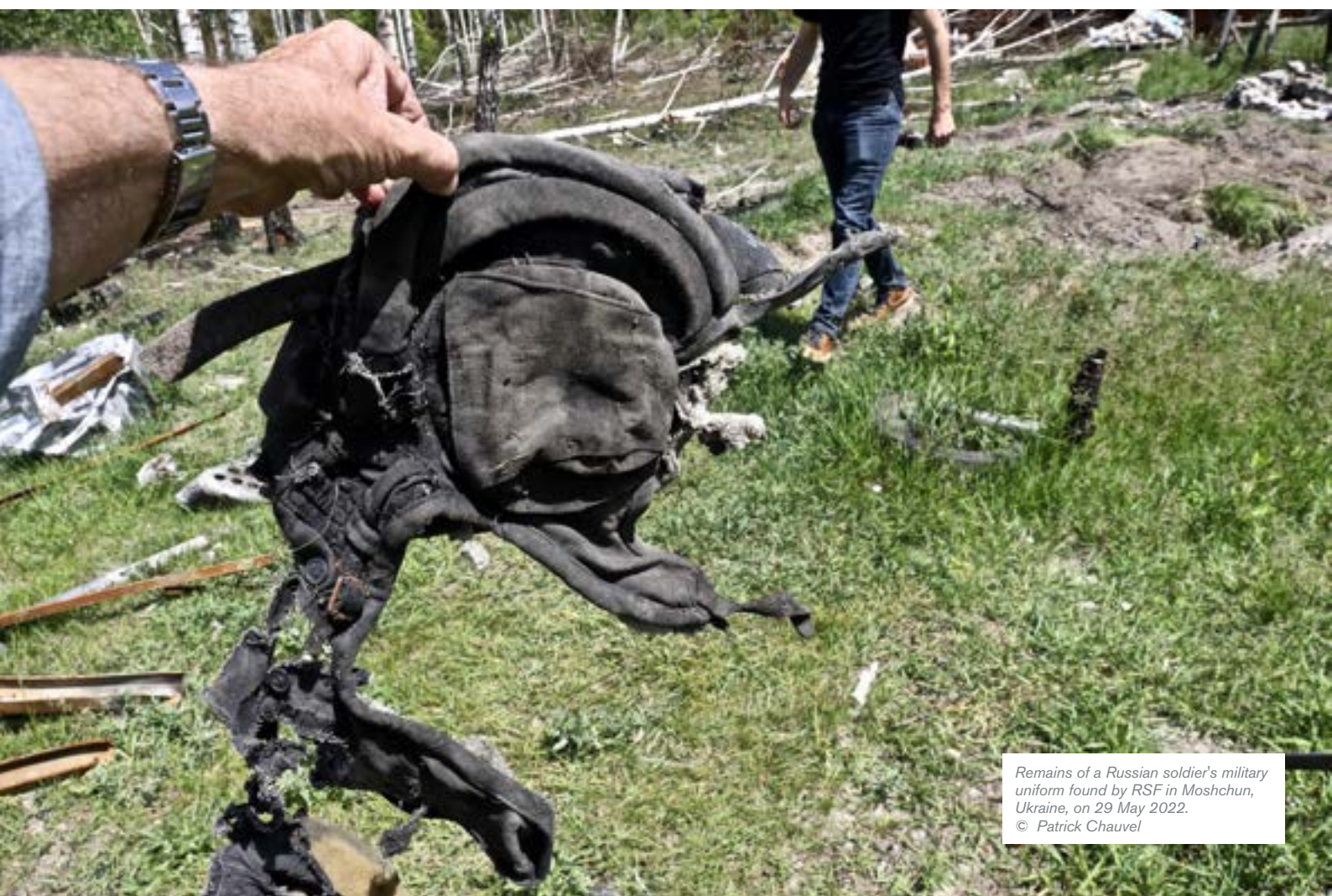
Remains of a Russian soldier's military uniform found by RSF in Moshchun, Ukraine, on 29 May 2022.