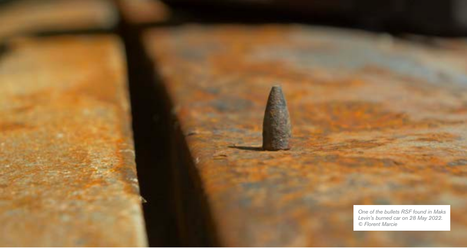
One of the bullets RSF found in Maks Levin's burned car on 28 May 2022.

During the first visit on 26 May, a three-hour search starting from the car's last recorded GPS point failed to locate the crime scene. But a second search two days later, on 28 May, did locate it. These were our observations: