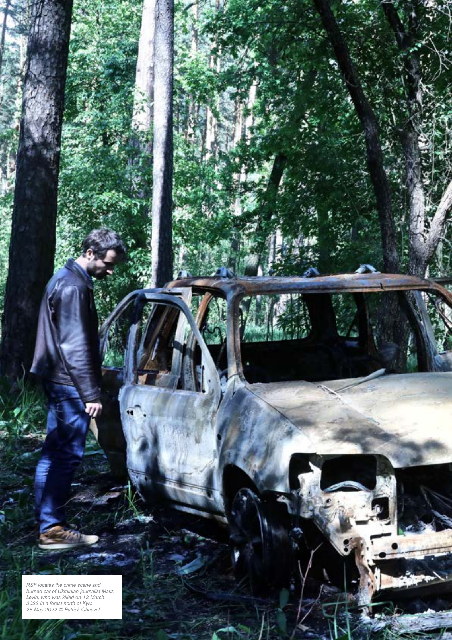
RSF locates the crime scene and burned car of Ukrainian journalist Maks Levin, who was killed on 13 March 2022 in a forest north of Kyiv. 28 May 2022