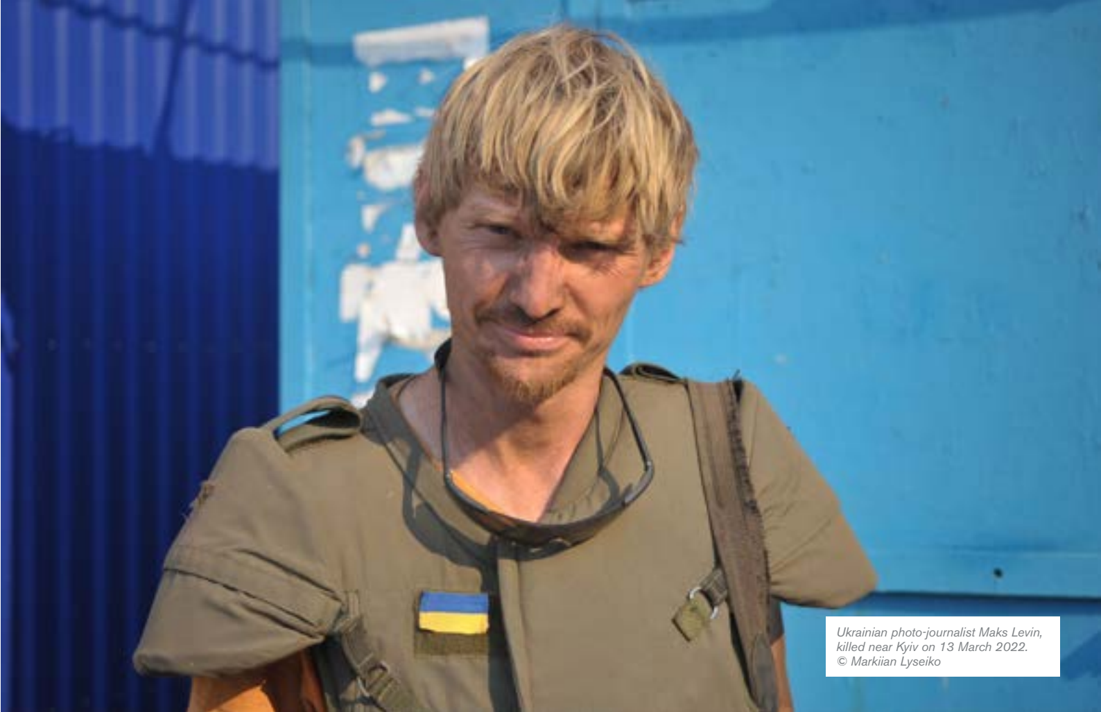
Ukrainian photo-journalist Maks Levin, killed near Kyiv on 13 March 2022. © Markian Lyseiko