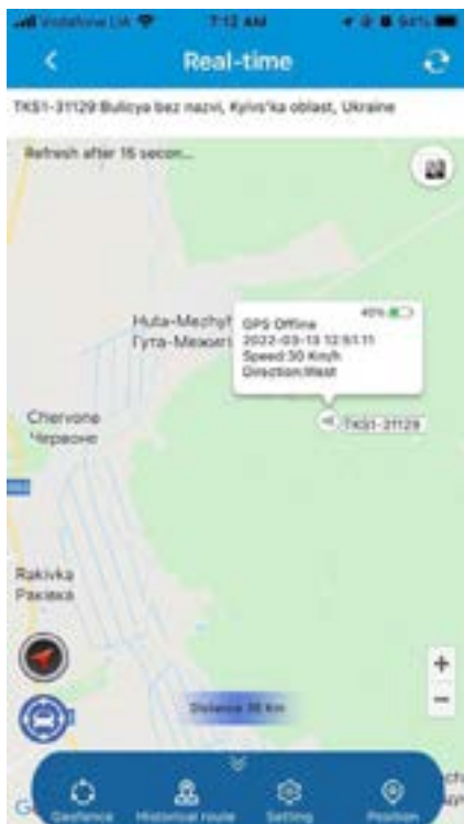
Screen grab from the GPS device in journalist Maks Levin's car showing its last position on 13 March 2022.